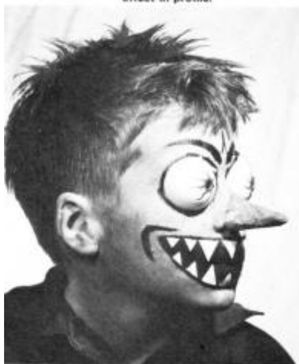
Effect in profile.

Cement or Duo Surgical Adhesive. When dry, remove from your pattern and trim the net as indicated in the book pattern.